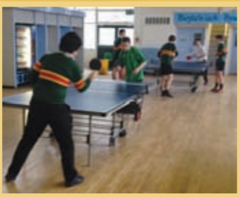
Table tennis has recently become the sport of choice at St Joseph's following the purchase of four new tables. Pupils have enjoyed brushing up on their skills in the 5 x 60 extra-curricular club which has proved extremely successful. As a result, we're hoping table tennis will be added to the curriculum in the next academic year.